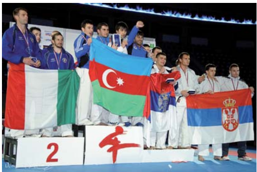
The strong team of the AKC Azerbaijan